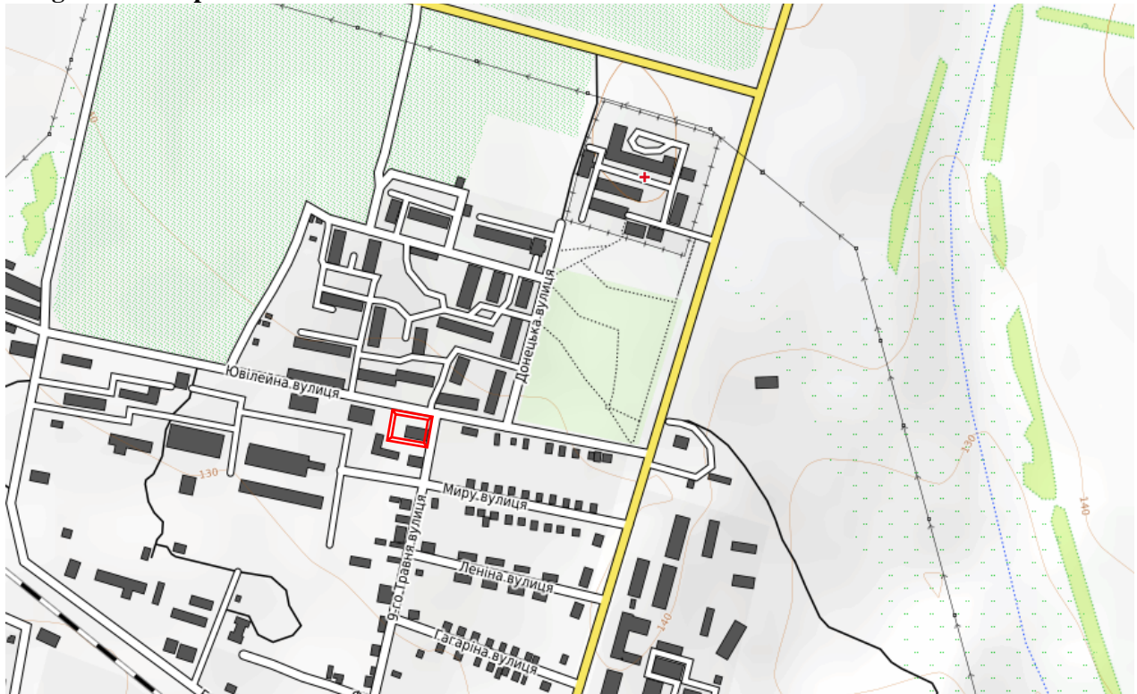
Image on the map

Speedway (highway): - km Road of national importance: Motorway T-0510 - 0.3 km Railway station: Zoloti Prudy Station – 3.1 km Sea (river) port: Mariupol City – 310 km Airport: Kharkiv International Airport - 210 km.